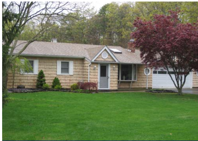
1/4 acre of natural landscape on each side

Ranch .92 acre Eastport South-Manor SD 3 Bedrooms 1 Bath 16x40 Double Roman-End In-ground heated pool 22x15 Sunroom Hardwood Floors Granite Fireplace Central Air Conditioning Eat-In-Kitchen California Closets Landscape Lighting 2 Sheds 2.5 Car Garage Hot Water Heater 3 Skylights Architectural Roof Taxes: $7,080 Priced to Sell: $395,000